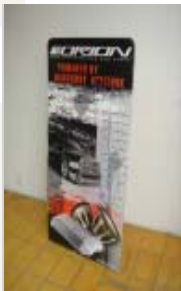
Point-Of-Sale stands, posters, racks and other support materials