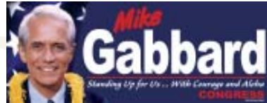
Banners, signage, posters and other materials for directly conveying a message