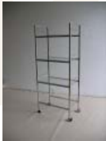
Glass shelves and other standard or custom shelving products and materials