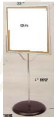
Poster holder floor stand