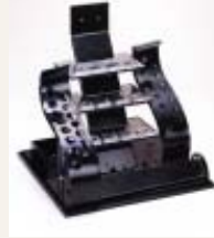
Cosmetic acrylic portable displays, and other portable display products from all materials