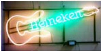
Neon signs of all types and sizes, along with other custom signage requests