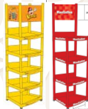
Plastic shelves and others