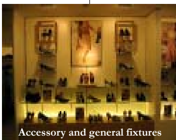
Accessory and general fixtures

4F, 7, Lane 125, Jin-Cheng Road Section 3, Tu-Cheng City, Taipei 236, Taiwan Tel: +886-2-8241-9490 / +886-9112-4218 Fax: +886-2-8245-5185 / +886-2-2261-7308 artdisplay@mail.apol.com.tw www.artdisplay.pctown.com.tw