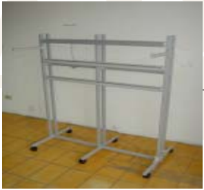
Standard and custom metal fixtures of all shapes and sizes