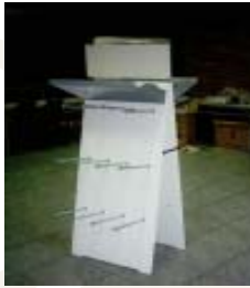
Custom designed wood fabrication Point-Of-Sale Stands