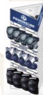
Accessory racks and displays